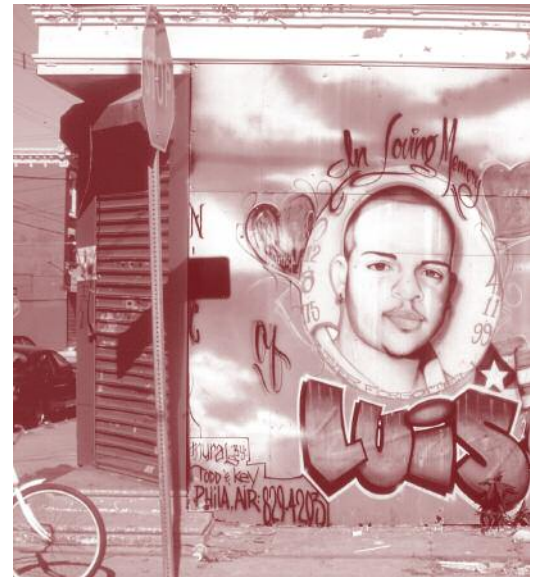
One of the many artistic examples of contemporary Urban Mourning Rituals that can be found throughout Philadelphia's neighborhoods.

FLHC is initiating the planning stages of the program, supported by a broad and impressive committee of stakeholders that includes experts from a range of disciplines in the arts, history, healthcare and community service. The enthusiasm and support with which the Urban Mourning Project has been met are testament to the significance of and need for such a program in Philadelphia. FLHC looks forward to working with our community partners in the continued development of the UMP, offering our city's youth alternative outlets for their aggression and pain, and working not only to provide solutions to violent crime, but also to open up honest, constructive and long-overdue discussions about the real causes of and meanings behind such violence. ■